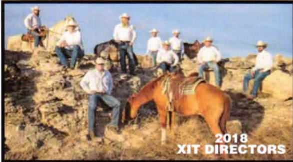
2018 XIT DIRECTORS

Thursday, Friday, & Saturday ★ August 2,3,4 2018 ★ Dalhart, TX